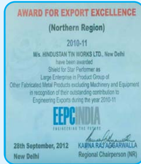
September, 2012 Award for Export Excellence (Northern Region) 2010-11