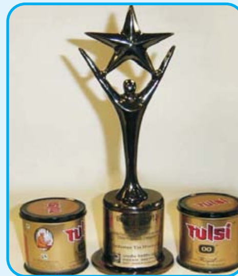
January, 2013 India Star Award 2012 for Zarda Pan Masala Can

One more award conferred in December 2012 for Oreo can at "mondelez india supplier summit" (cadbury)