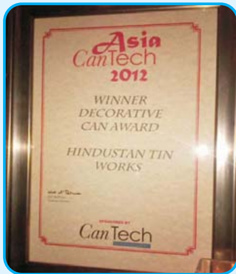
October, 2012 Asia CanTech Award 2012 for Oreo Cans