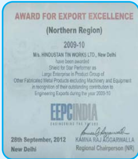
September, 2012 Award for Export Excellence (Northern Region) 2009-10

During the period of report, your Company has received the following prestigious awards: